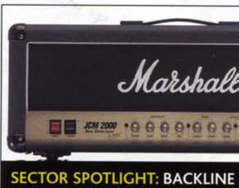
SECTOR SPOTLIGHT: BACKLINE

TRADITIONAL ■ HI-TECH ■ ROCK ■ CLASSICAL ■ EDUCATION ■ PRINTED MUSIC